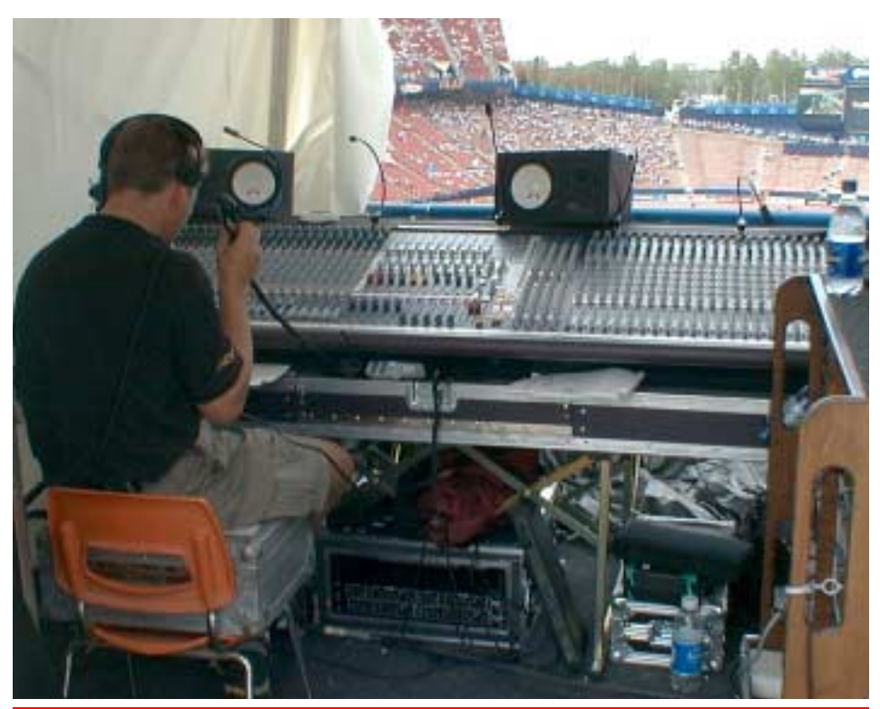
The Midas Heritage 1000 mixing console hard at work in the stadium's sound booth.