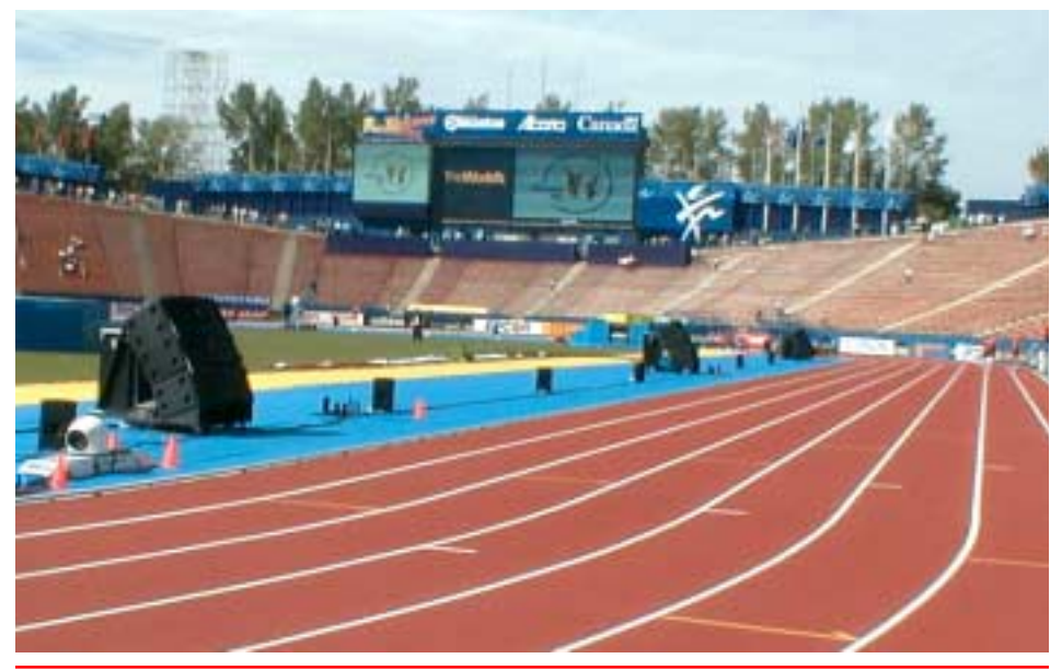
Three X-Line stacks on custom carts line the track at the 2001 IAAF World's.