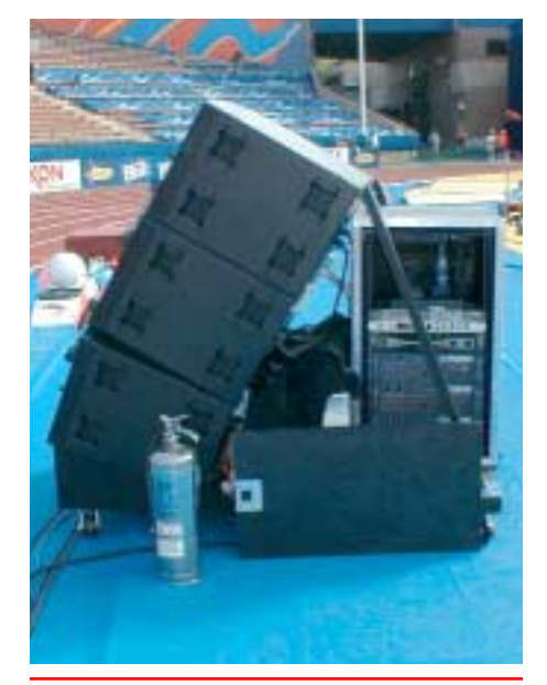
Closeup of the X-Line stacks with amps.