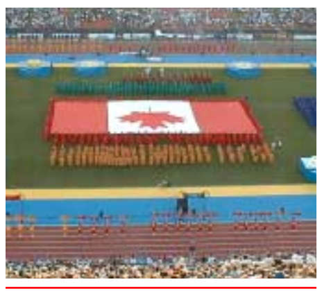
Full coverage to the top row from an X-Line stack during a ceremony at the World's.